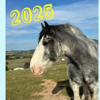
(Photograph is an example only – and is not featured in the calendar)

https://www.heavyhorseheaven.com.au/product-page/2025-hhh-calendar The calendars are $25 each including postage.