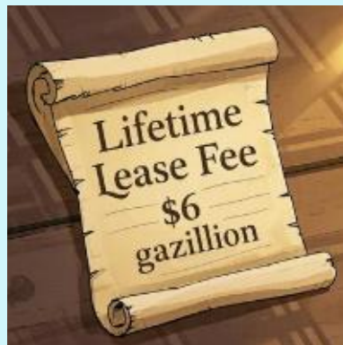
Fees can vary