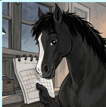
Diesel checking out the calendar